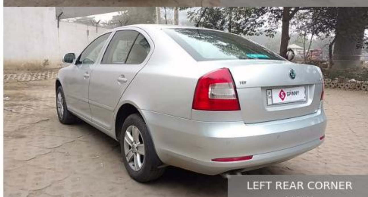
LEFT REAR CORNER VIEW