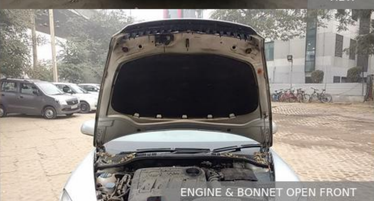
ENGINE & BONNET OPEN FRONT VIEW