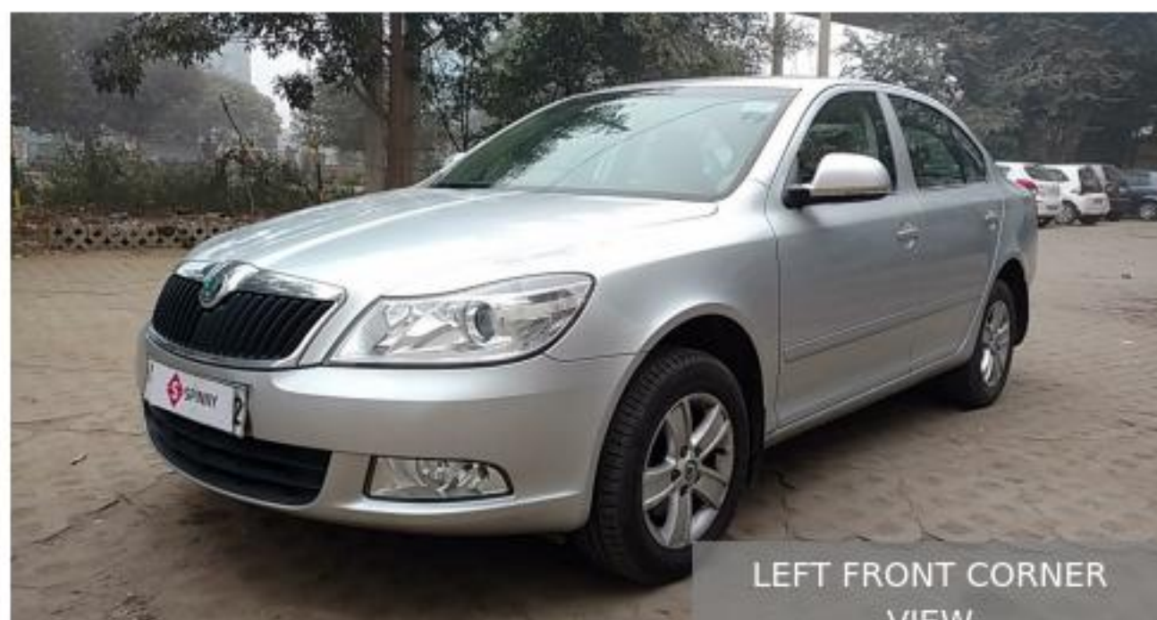
LEFT FRONT CORNER VIEW

Insurance: Comprehensive (Dec. 2016) Reason for sale: Buying a new car